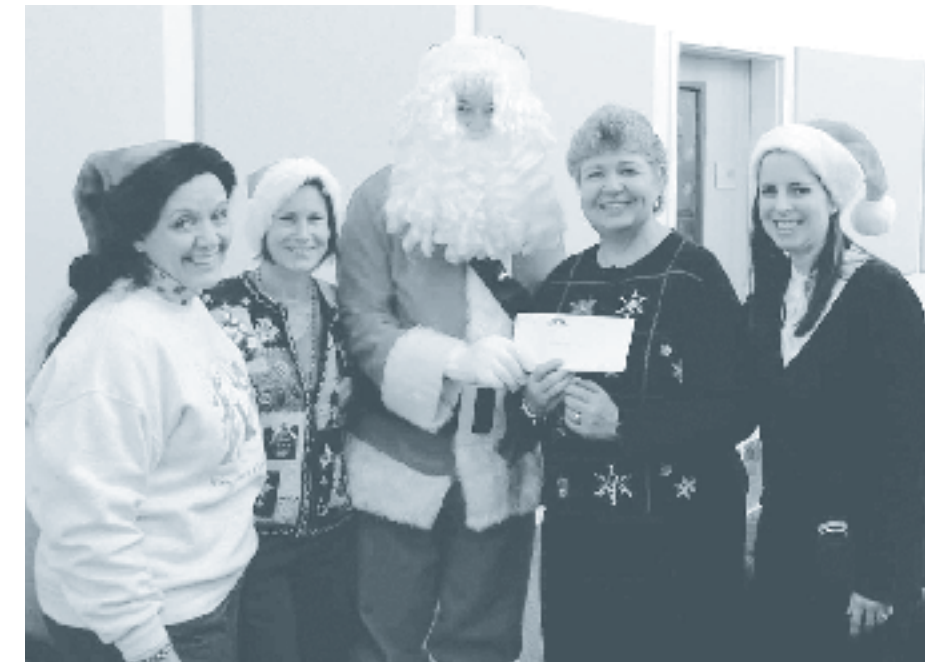
Employees of ATK have been bringing Christmas to The Center for many years